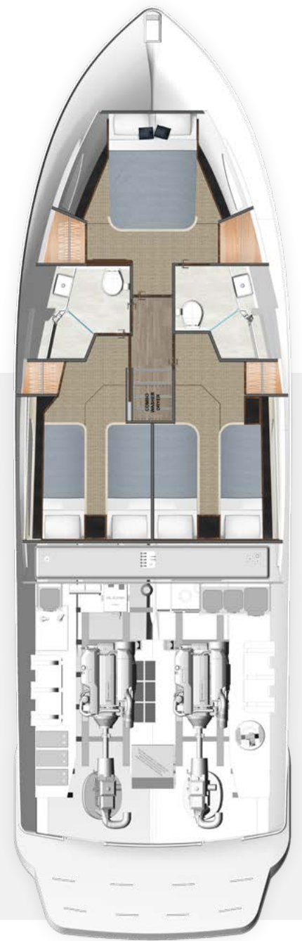
ACCOMMODATION DECK Shown with optional twin beds to Port