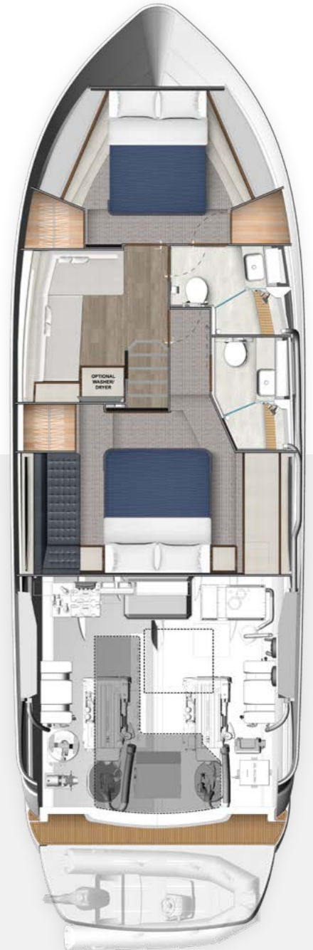
ACCOMMODATION DECK Shown with optional washer/dryer