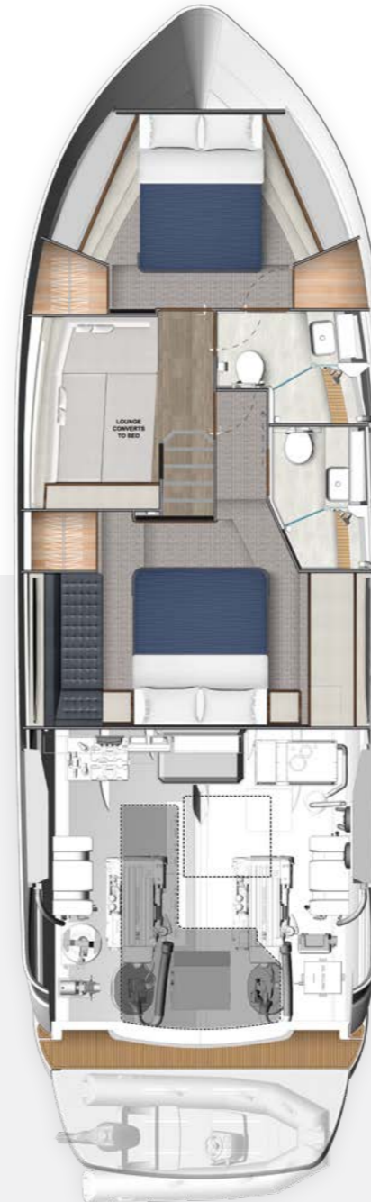
ACCOMMODATION DECK Shown with optional foldout bed