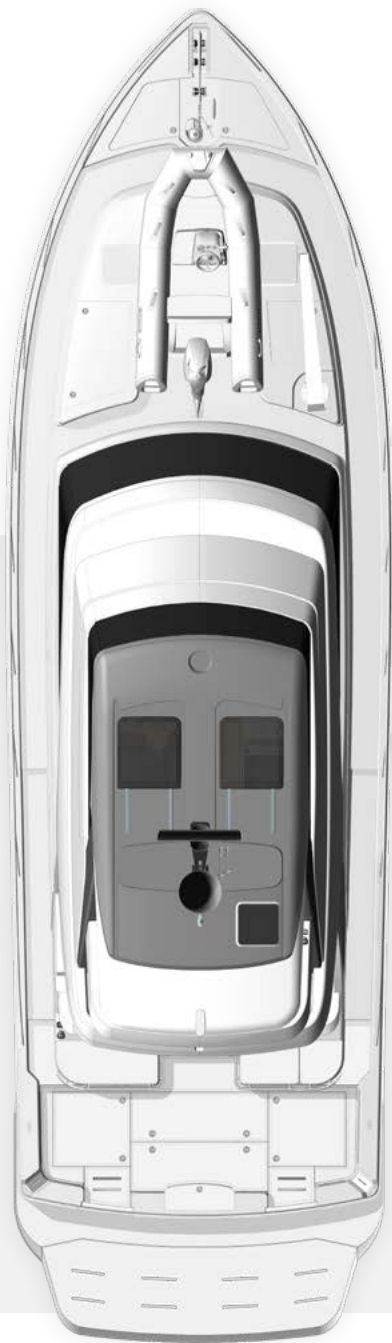
HARDTOP Shown with optional tender and davit