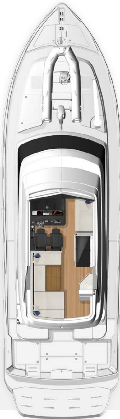
FLYBRIDGE DECK Shown with optional foredeck sunpad