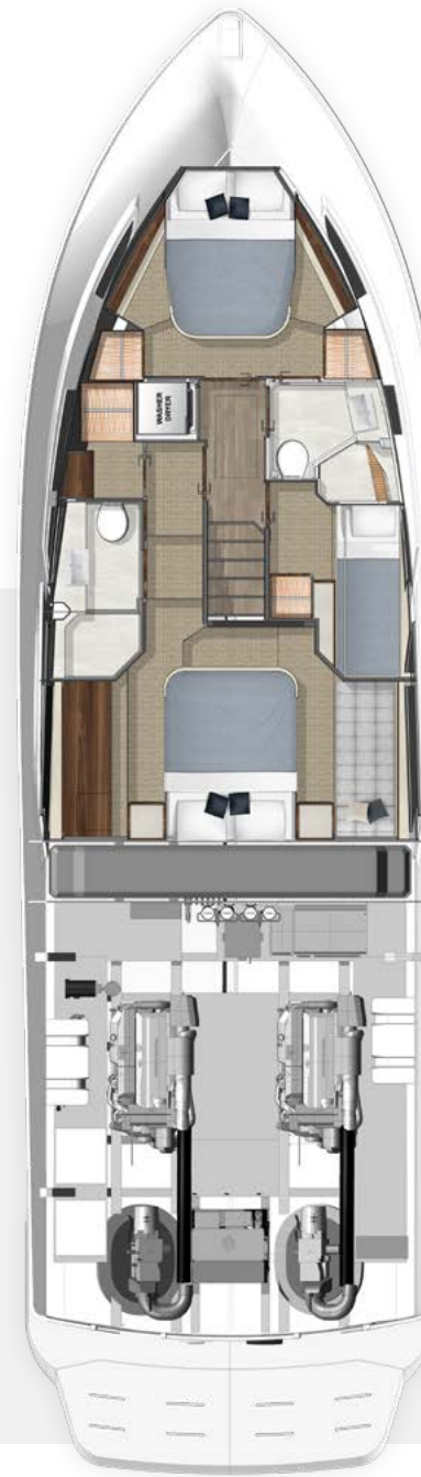
ACCOMMODATION DECK Shown with optional gyro