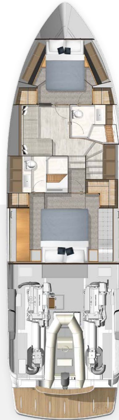
ACCOMMODATION DECK Shown with optional lower lounge design