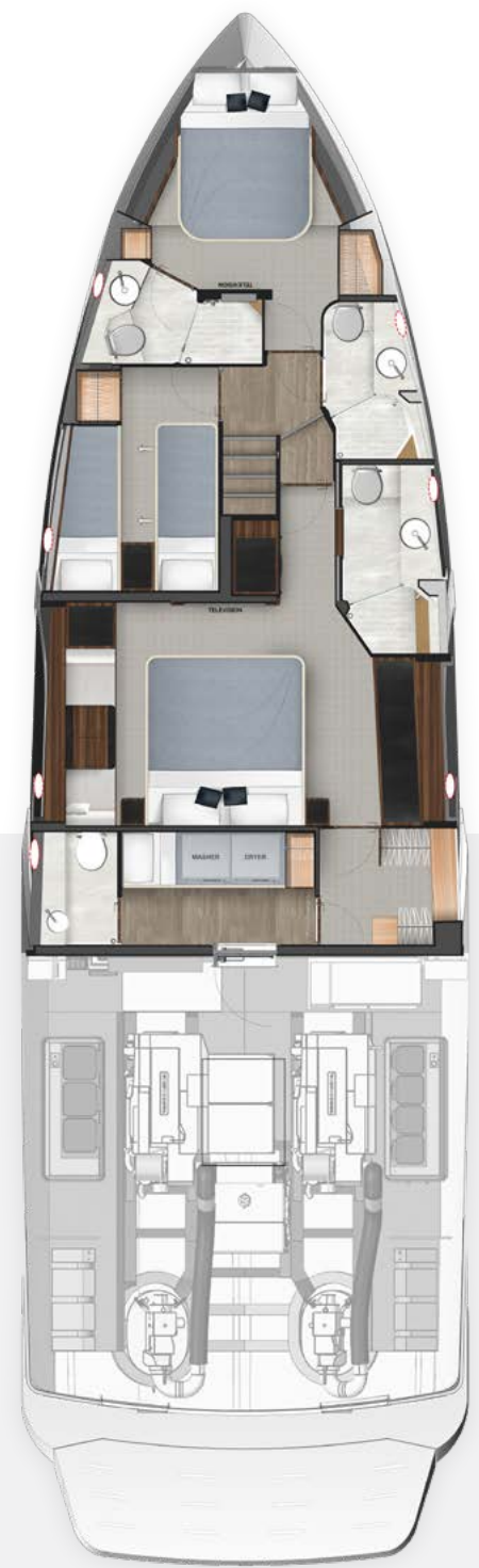
ACCOMMODATION DECK Shown with optional crew cabin