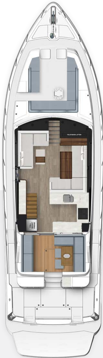
SALOON DECK Shown with optional foredeck lounge