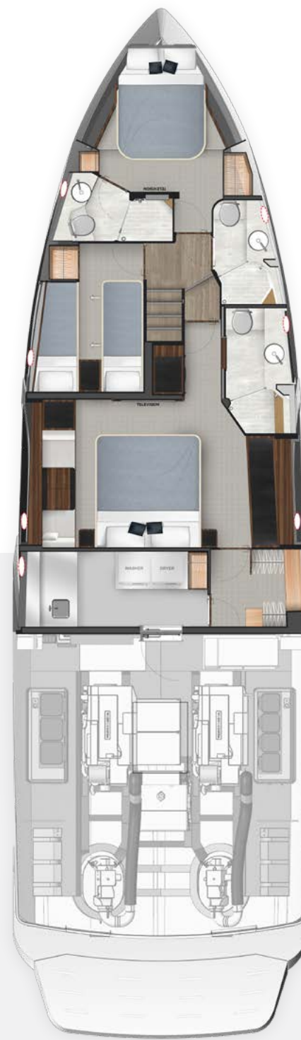
ACCOMMODATION DECK Utility room