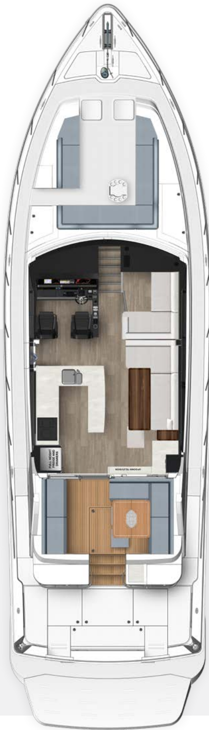
SALOON DECK Shown with optional Foredeck Lounge