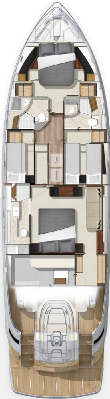
ACCOMMODATION DECK Classic design