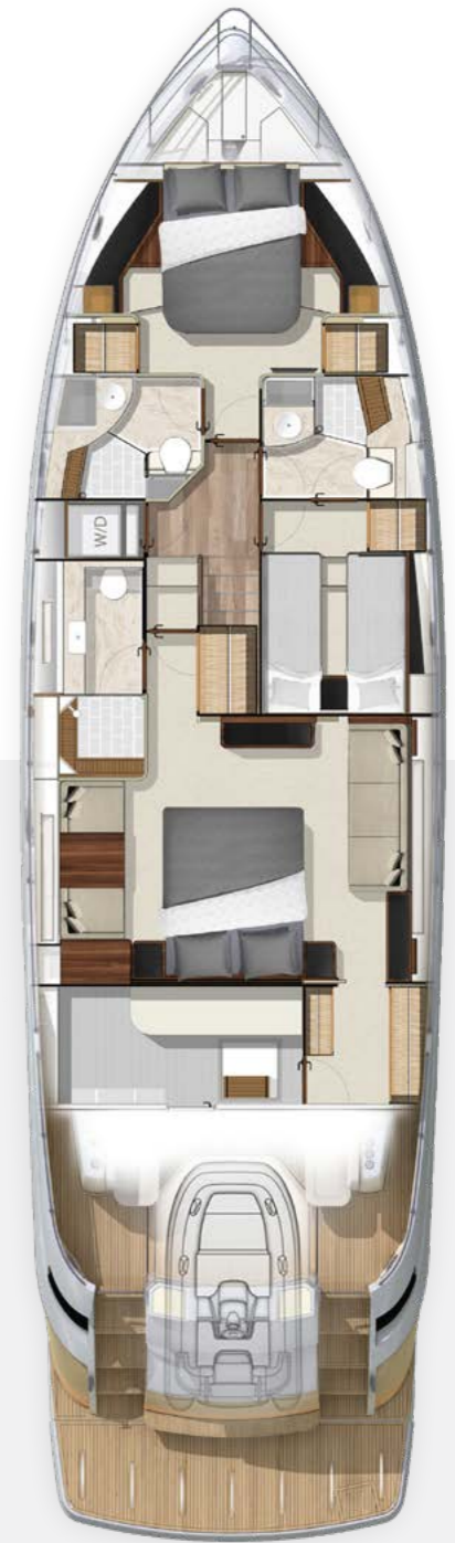
ACCOMMODATION DECK Shown with optional Presidential design