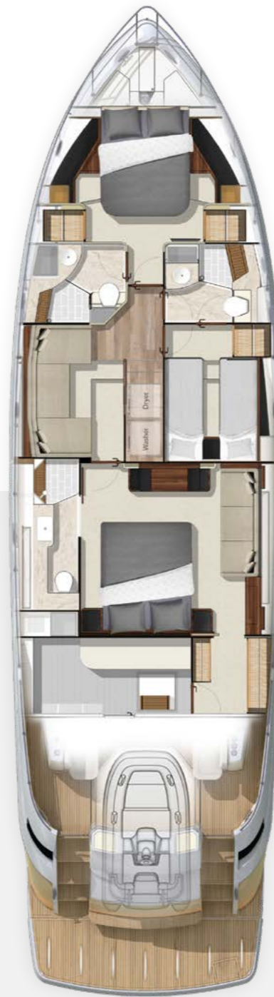
ACCOMMODATION DECK Shown with optional lower lounge design