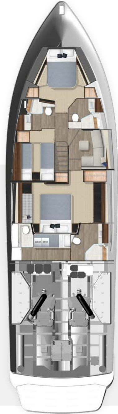
ACCOMMODATION DECK Shown with optional lower lounge with single crew cabin/laundry