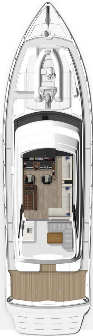
FLYBRIDGE DECK Shown with optional tender and davit