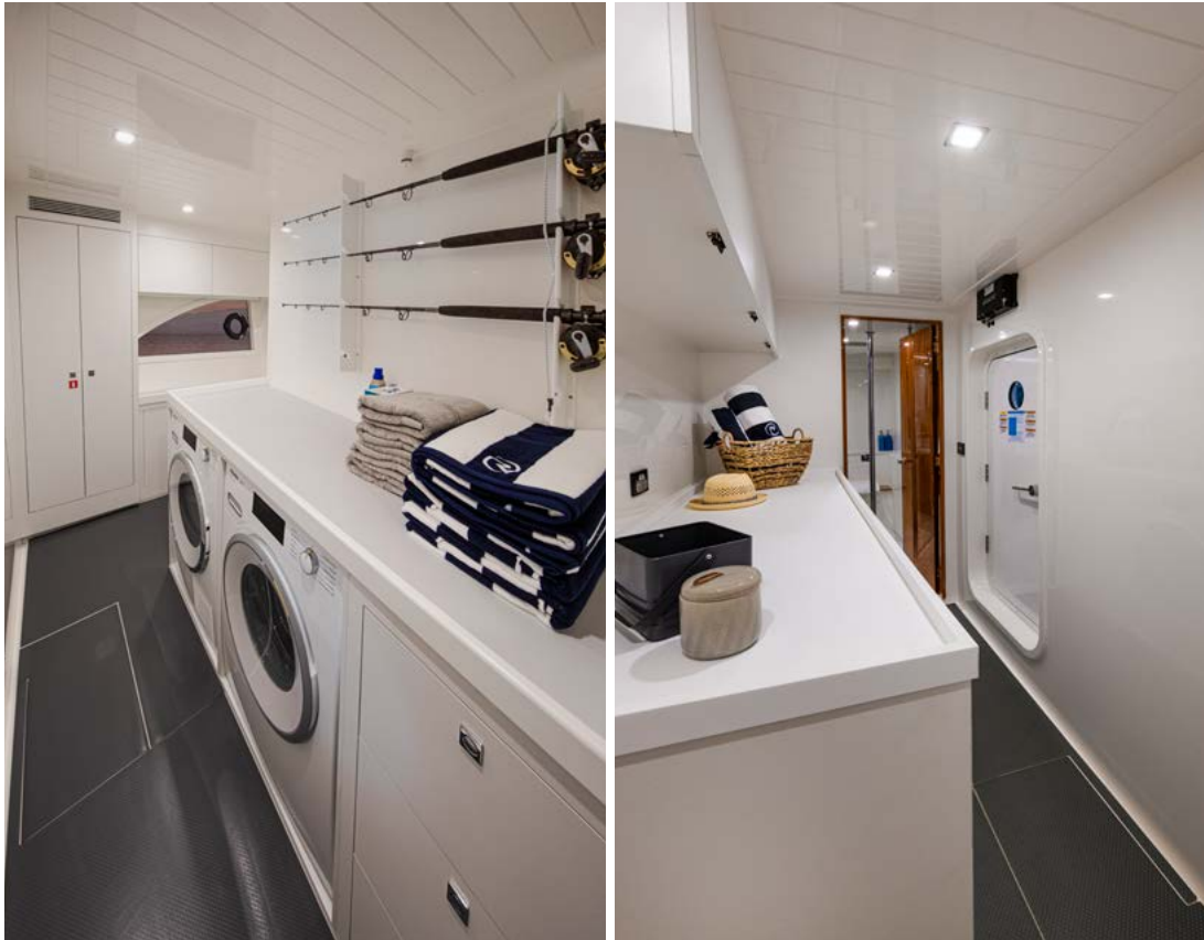
Custom options shown