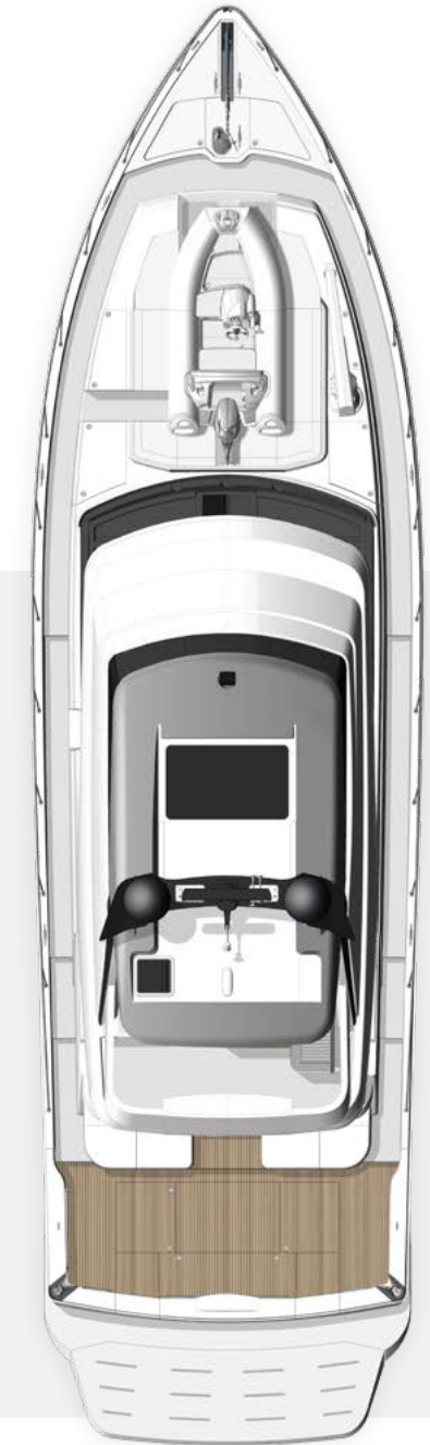
HARDTOP Shown with optional teak floor

*Specifications may vary on a regional basis.