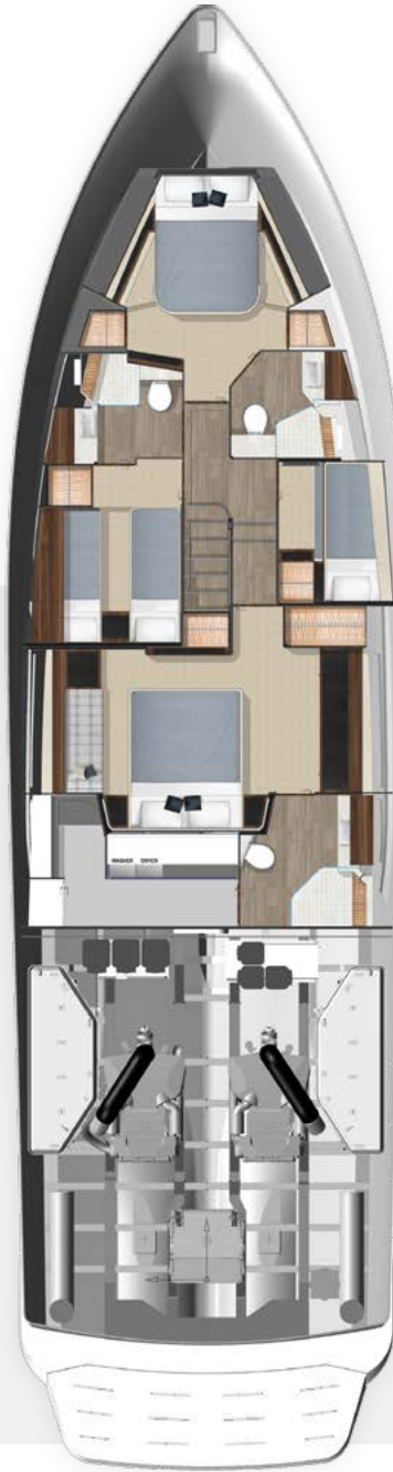
ACCOMMODATION DECK Classic 4 cabin layout with utility/laundry room