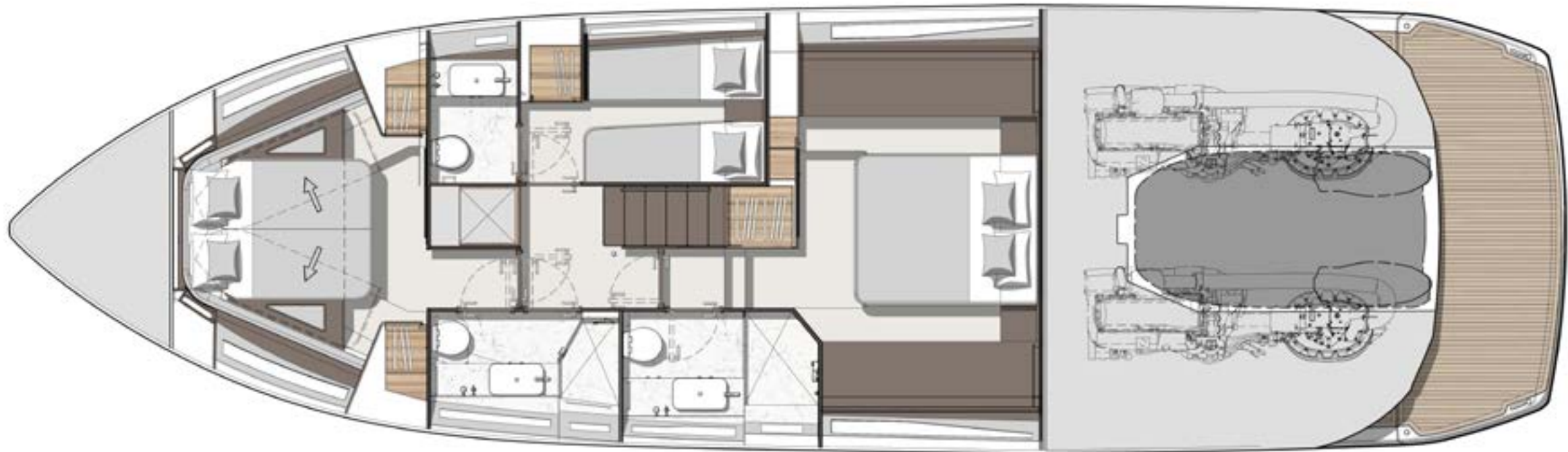
LOWER DECK WITH TWIN CABIN OPTION