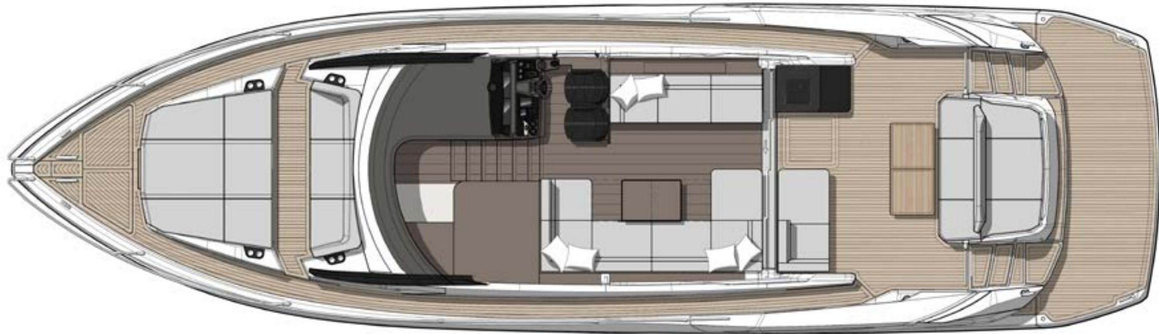
MAIN DECK (STARBOARD SOFA)